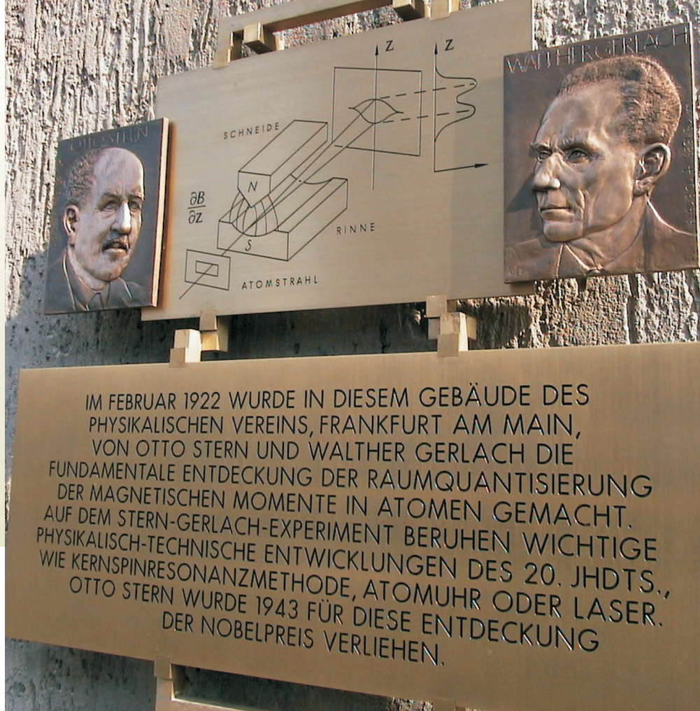
Figure 1. A memorial plaque honoring Otto Stern and Walther Gerlach, mounted in February 2002 near the entrance to the building in Frankfurt, Germany, where their experiment took place. The inscription, in translation, reads: “In February 1922 . . . was made the fundamental discovery of space quantization of the magnetic moments of atoms. The Stern–Gerlach experiment is the basis of important scientific and technological developments in the 20th century, such as nuclear magnetic resonance, atomic clocks, or lasers. . . .” The new Stern–Gerlach Center for Experimental Physics at the University of Frankfurt is under construction about 8 km north of the original laboratory.

with his student Elisabeth Borman, to measure the mean free path for a beam of silver atoms attenuated by air. In Stern’s first beam experiment, reported in 1920 and motivated by kinetic theory, he determined the mean thermal velocity of silver atoms in a clever way. He mounted the atomic beam source on a rotating platform—a miniature merry-go-round—that spun at a modest peripheral velocity, only 15 meters per second. That produced a small centrifugal displacement of the beam indicative of its velocity distribution as imaged by faint deposits of silver. From the shift of those deposits, caused by reversing the direction of rotation, Stern was able to evaluate the far larger mean velocity of the atoms—about 660 m/s at 1000°C. Soon thereafter, his design for the SGE would invoke an analogue to test the Bohr model: A magnetic field gradient should produce opposite deflections of the beam atoms, according as the planetary electron rotates clockwise or counterclockwise about the field axis.