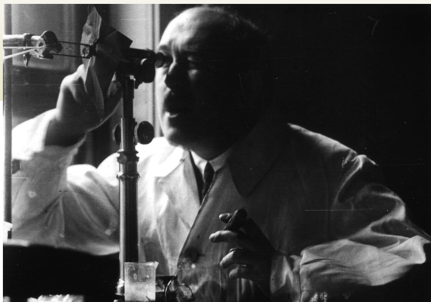
Figure 2. Otto Stern (1888–1969), cigar in hand, working in his molecular beam laboratory at the Institute for Physical Chemistry in Hamburg, about 1930.

Copenhagen said to me in a friendly manner, “You look very unhappy,” whereupon I answered fiercely, “How can one look happy when he is thinking of the anomalous Zeeman effect?” 6